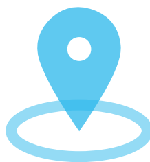
Fillable Tracking Guide