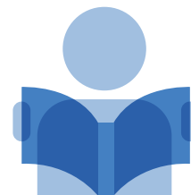
Mission Trip Guide 6 Volunteer Away From Home Opportunities