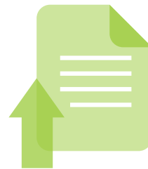
Online Application Form

Click an image to access the resource you need!